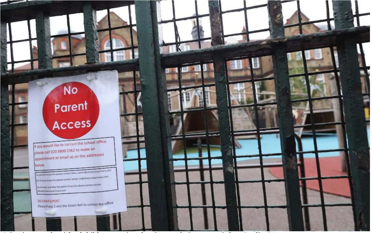
Scientists say the risk of children passing the virus to their parents is low

However, in contrast, the experts warn that a lack of schooling increases inequalities, reduces the life chances of children and can "exacerbate physical and mental health issues". These problems cannot be resolved through "home-based education alone".